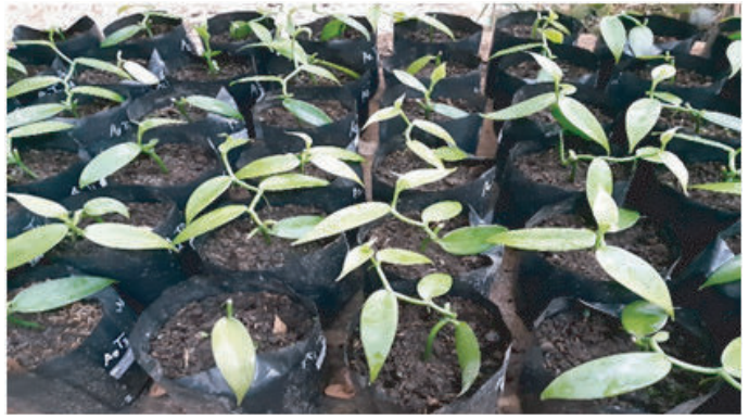
Fig. 1. Vanilla cuttings 90 days after planting (DAP).

Note: Numbers followed by different letters for the same parameter show a significant difference from Duncan's test at the 95% level.